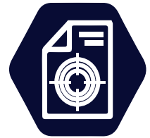
Correspondence & Unique Document Solutions